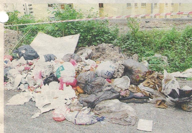
Not a pretty sight: Rubbish strewn all over the streets takes up almost half of the road and obstructs traffic.

"I urge all residents to co-operate and to dispose their rubbish properly. This is a problem that can only be solved through the cooperative efforts of the community," Goh said.