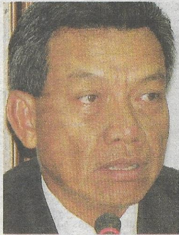
PAIMAN: Temporary exhibitions are being held

The department's response came about following a special report by TV3's Buletin Utama , aired on Monday, which criticised the timing of the upgrade.