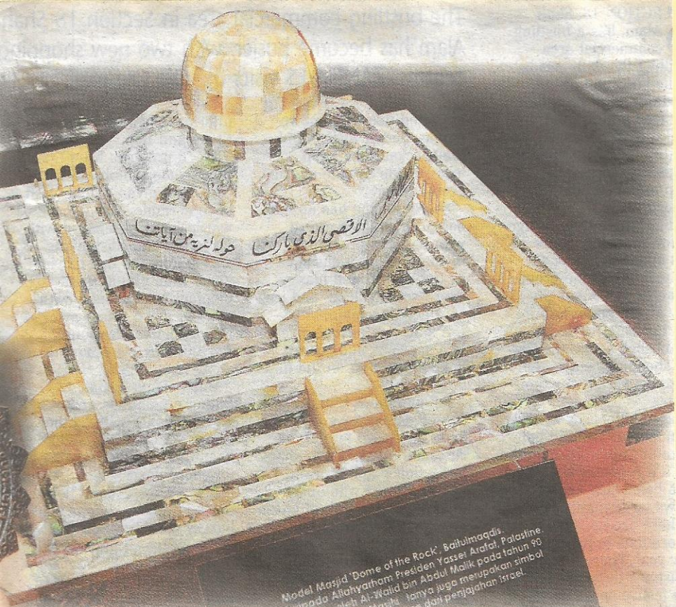
Model Masjid 'Dome of the Rock', Baitulmaqdis, diampada Allahyatham Presiden Yasser Arafat, Palestinie, yang oleh Al-Walid bin Abdul Malik pada tahun 90 Masehi, hanya juga merupakan simbol dari penjajahan Israel.

FROM ARAFAT: A model of the Dome of the Rock, in mother of pearl, a gift to the sultan from Palestinian leader Yasser Arafat.