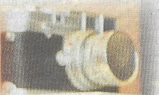
CLICK: The late Sultan collected quite a number of cameras. Here are two models.

The late Sultan's ancestry can be traced back to the Bugis Sulawesi family of Opu Tanreburung Daeng Relaka who featured in the history of the Malay Archipelago.