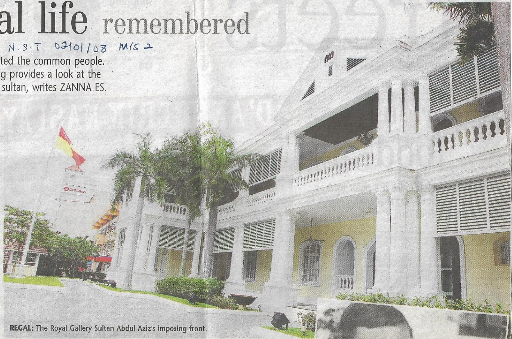
REGAL: The Royal Gallery Sultan Abdul Aziz's imposing front.

The palace was renovated, with the support of the State Government, and opened to the public in the year 2000, renamed the Royal Gallery Sultan Abdul Aziz, in honour of his birthname.