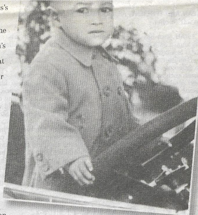
THE PRINCE: One of the earliest photographs of Sultan Salahuddin Abdul Aziz Shah, age 4.

Also displayed are some of the late Sultan's personal belongings including his favourite gold watch bearing the Selangor state crest, and a boxed watch bearing the picture of the late Sultan and the late Tengku Ampuan Rahimah.