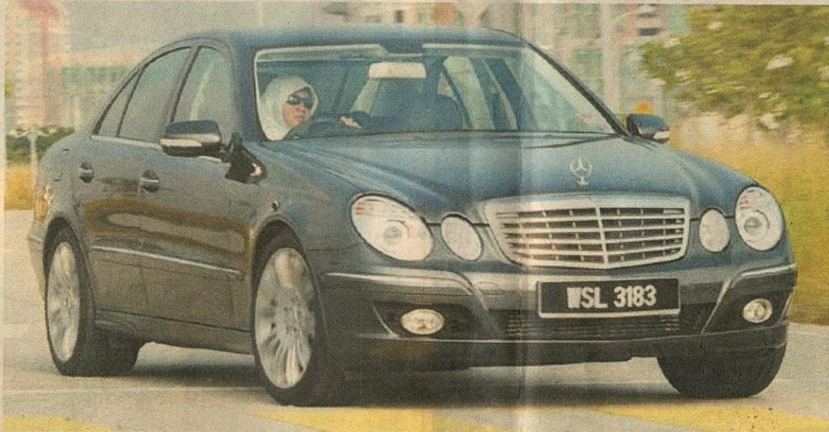
Bigger wheels and lowered ride height certainly help bring out the sporty side of the E 200 K.

The car also sits lower than the normal version, thanks to the sports suspension. The rear gets dual stain-