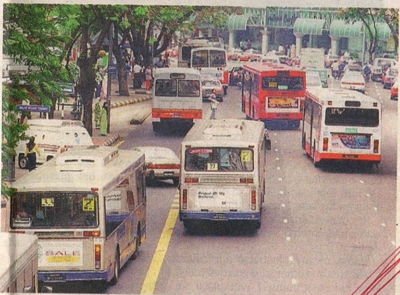
All tied up: Currently, public transportation in the city is not under the purview of the DBKL.