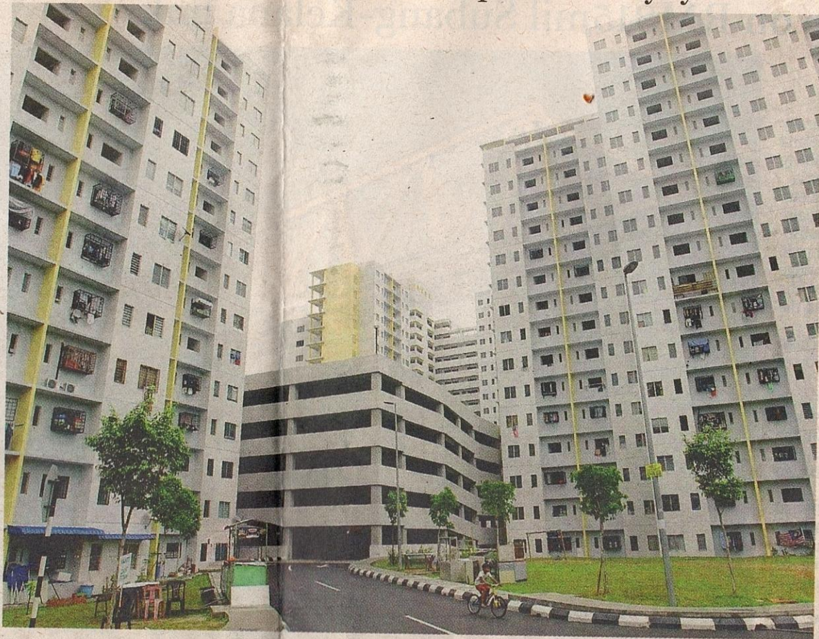
Under scrutiny: Public housing will be one of the area's the committee will focus on.

"Another crucial area is the delivery system, central to the idea of a