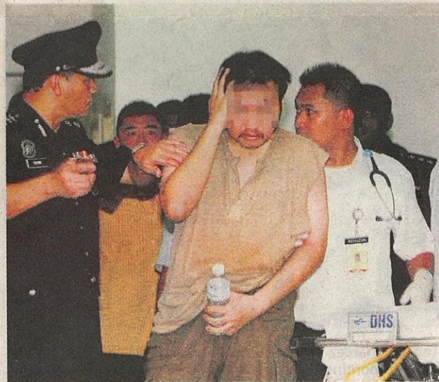
One of the three men leaving his 'prison' yesterday with the help of a policeman and a medical officer.