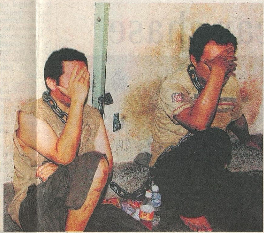
The three men who were held captive by loan sharks after they failed to repay their loans.