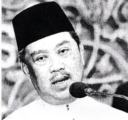
Deputy Prime Minister Tan Sri Muhyiddin Yassin says the government expects the Budget to boost the economy

Muhyiddin said the Budget was also an important foundation to create new economic models focusing on innovation and creativ-