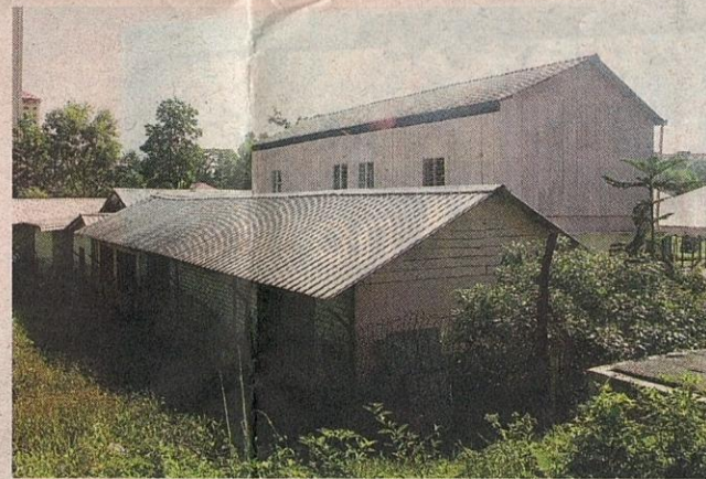
SJKT Ladang Bukit Jalil, which has 90 pupils, is in a dilapidated condition.

Muhyiddin said his visits to the two schools were fruitful as he now understood the issues and problems in the education sector better.