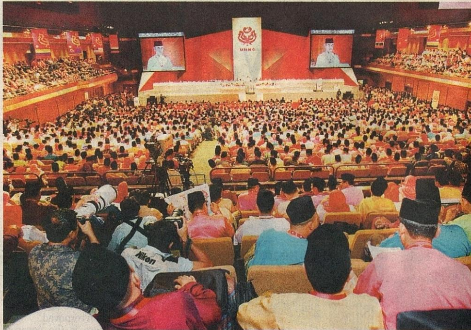
A section of the Umno delegates at the opening of the Umno general assembly at Putra World Trade Centre in Kuala Lumpur yesterday morning.

Nonetheless, Umno is facing a test of credibility. Why are we suffering this fate, blamed to this terrible extent? Why are we now seen to be completely without virtue? This situation has placed a heavy test of credibility on Umno.