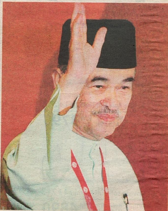
Umno president Datuk Seri Abdullah Ahmad Badawi waves as he arrives at Putra World Trade Centre, Kuala Lumpur, for the opening of the Umno general assembly yesterday.

In the 63 years since its founding, Umno has succeeded. Umno has contributed towards the unity of the Malays, stoked the fires of Malay nationalism, upheld the dignity of Islam, restored the sovereignty of the Malay rulers, forged understanding and cooperation between the races, negotiated