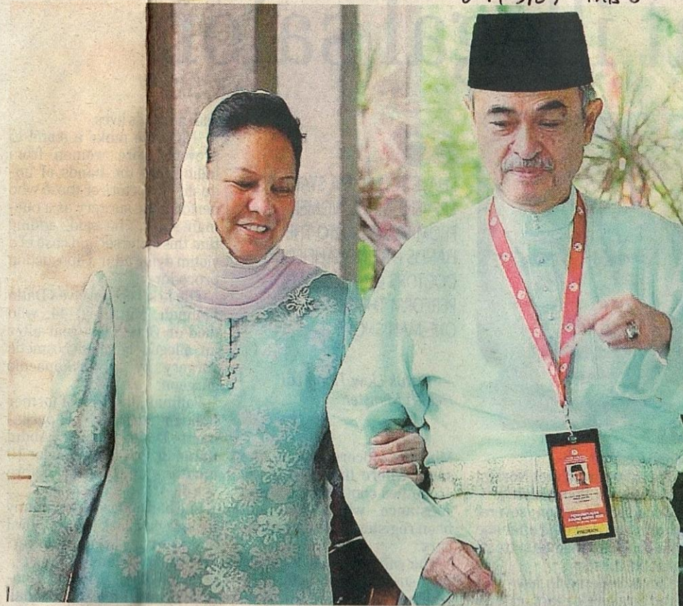
Prime Minister and Umno president Datuk Seri Abdullah Ahmad Badawi and his wife Datin Seri Jeanne Abdullah step out from their residence Seri Perdana in Putrajaya, to attend the Umno general assembly at Putra World Trade Centre in Kuala Lumpur.

In my eyes, Umno was a party that held high ideals; and there was sanctity in its struggle to serve. When I joined, it never crossed my mind that I should expect to be rewarded with any benefits, material or otherwise. I must emphasise that I was not unique; the tens of thousands of my colleagues and compatriots who were in Umno then felt the same way. We all resolved to work towards bringing our people and beloved country to the highest pinnacle of success. In fact, when I officiated at that Youth and Wanita assembly in 1999, the theme of my speech was "Continuing the struggle — Uplifting our people".