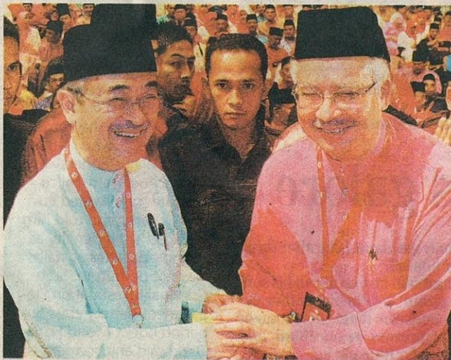
Outgoing Umno president Datuk Seri Abdullah Ahmad Badawi and Umno president-elect Datuk Seri Najib Razak at the Umno general assembly in Kuala Lumpur yesterday.