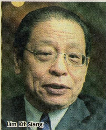
Lim Kit Siang

In a press statement, PKR president Datuk Seri Dr Wan Azizah Wan Ismail said the party will, however, not stop or dispute any party's wishes to discuss issues which involves