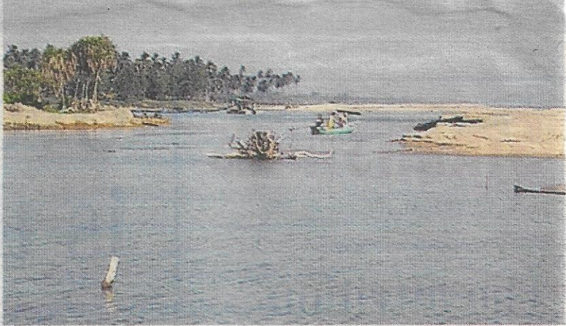
Kuala Pa'Amat was where the Japanese invasion took place on the night of Dec 8, 1941.