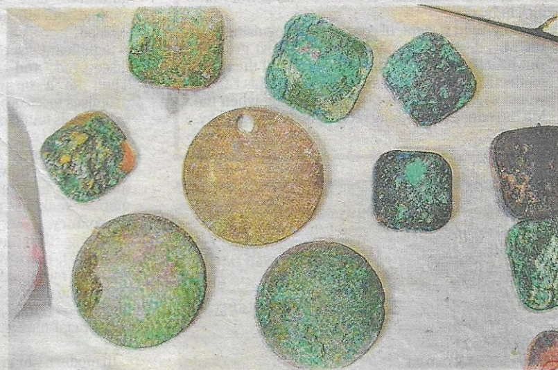
Dog tags and old coins dating to 1920 were found at Kuala Pa' Amat.