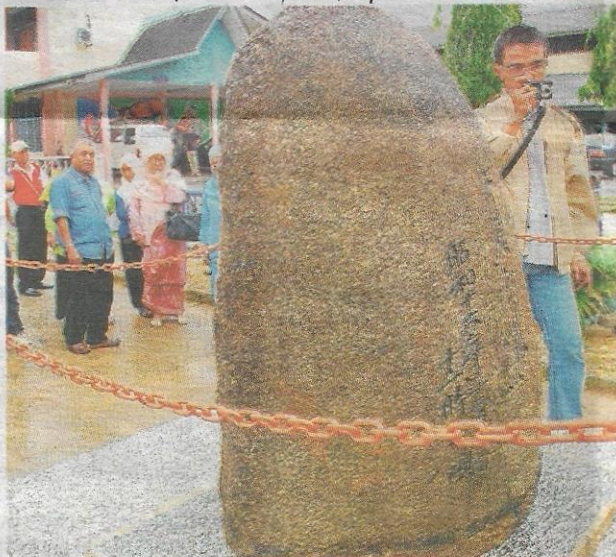
The 'Batu Bersurat' at SMK Hamzah was placed by the Japanese to mark the defeat of the British in Machang.