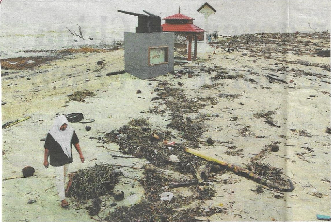
The RM200,000 memorial at Pantai Sabak built to mark the place the Japanese landed is now prone to erosion.