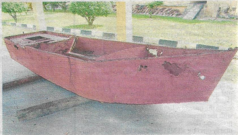
A Japanese landing boat found in Sungai Kelantan in 1988.