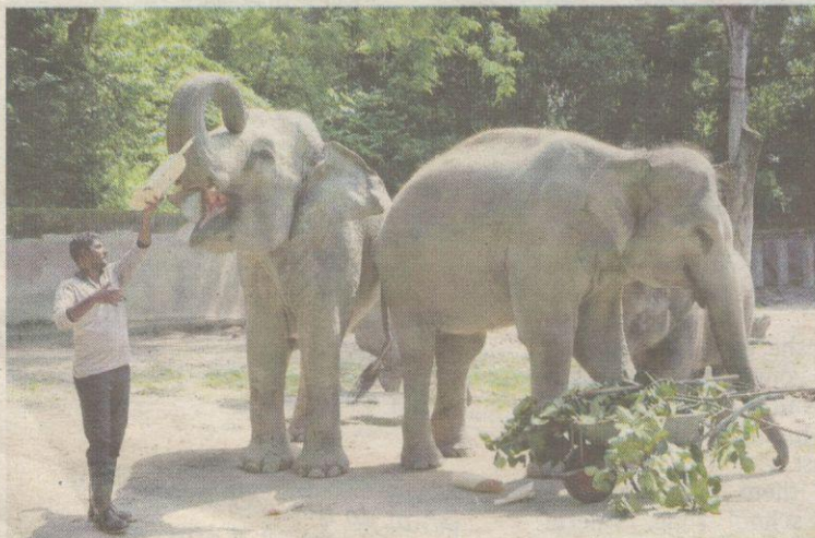
Jumbo diet: It is meal time for the mighty elephants.