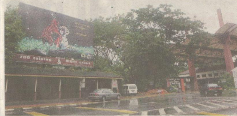
Welcome all: The entrance of the Taiping Zoo and Night Safari.

Personal with animals at the Taiping Zoo