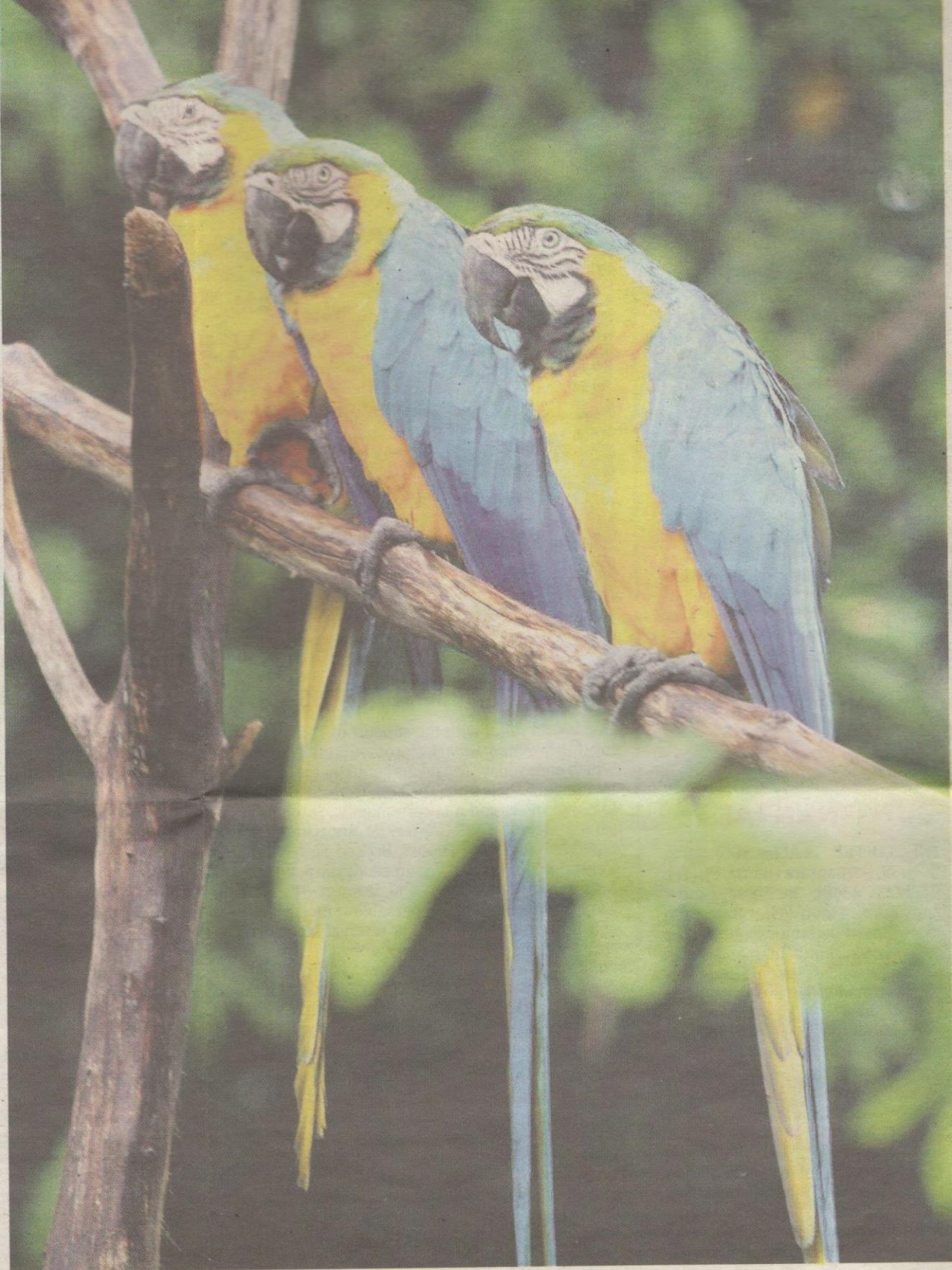
Pretty birds in a row: Three blue-and-yellow macaw perching on a branch.