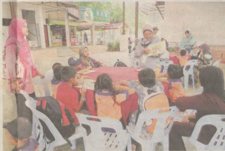
Full attention: Children and parents listening to a Taiping Zoo and Night Safari ranger explaining about the elephant during the educational programme.

other tourist destinations in Taiping would be highlighted in a gallery that was under construction.