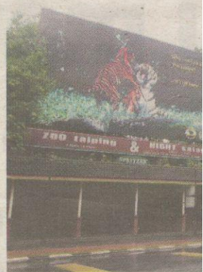
Welcome all: The entrance to the

Visitors are transported into a different realm when they enter two separate large dome enclosures, which house the milky stork and the scarlet ibis, as they push aside the metal gates to observe the birds building their nests or flying freely about.