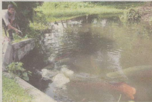
Expensive breed: The arapaimas swimming in one of the ponds.

Visitors are transported into a different realm when they enter two separate large dome enclosures, which house the milky stork and the scarlet ibis, as they push aside the metal gates to observe the birds building their nests or flying freely about.