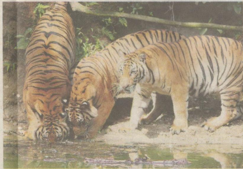
Protected species: Tigers drinking water from the stream in their enclosure.

"Among the facilities to be put in place are interactive and information signage on the animals, in addition to