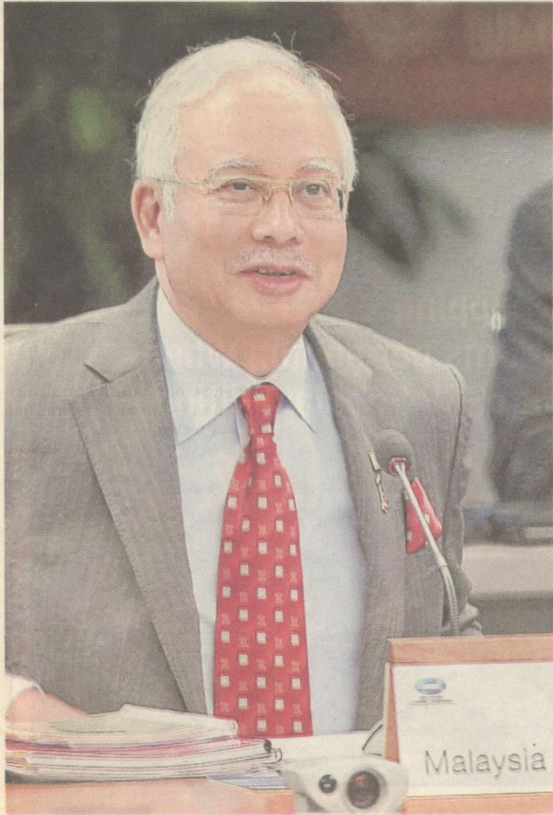
Prime Minister Datuk Seri Najib Razak calls on the peace-loving moderate majority to reclaim their place in the centre.