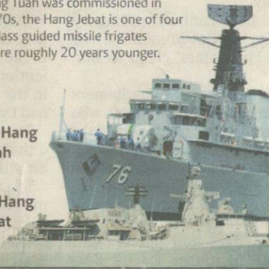
KD Hang Jebat