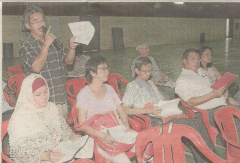
People on the ground: A resident from SS15 giving his feedback on the proposed traffic management and upgrade scheme in SS15, Subang Jaya.