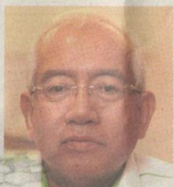
Datuk Seri Mahdzir Khalid Education