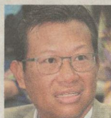
Datuk Seri Ahmad Shabery Cheek Agriculture & Agro-based Industry (Former Communication & Multimedia)