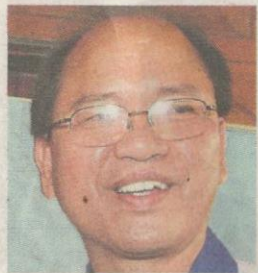
Datuk Wilfred Madius Tangau Science, Technology & Innovation