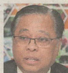
Datuk Seri Ismail Sabri Yaakob Rural & Regional Development (Former Agriculture & Agro-based Industry)