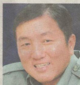
Datuk Seri Ong Ka Chuan International Trade & Industry II