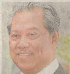
Tan Sri Muhyiddin Yassin Deputy Prime Minister and Education