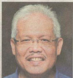
Datuk Hamzah Zainuddin Domestic Trade, Cooperatives & Consumerism