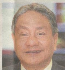
Datuk Seri Hasan Malek Domestic Trade, Cooperatives & Consumerism