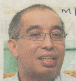
Datuk Seri Salleh Said Keruak Communication & Multimedia