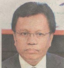
Datuk Seri Shafie Apdal Rural & Regional Development