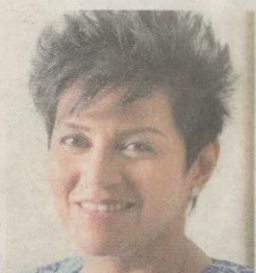
Datuk Seri Azalina Othman Said PM's Department