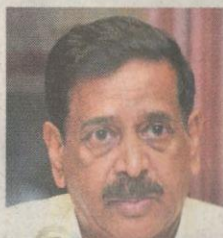
Datuk Seri G. Palanivel Natural Resources & Environment