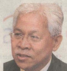
Datuk Seri Idris Jusoh Higher Education (Former Education II)