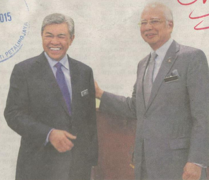
All smiles: Najib congratulating Dr Ahmad Zahid on his promotion.