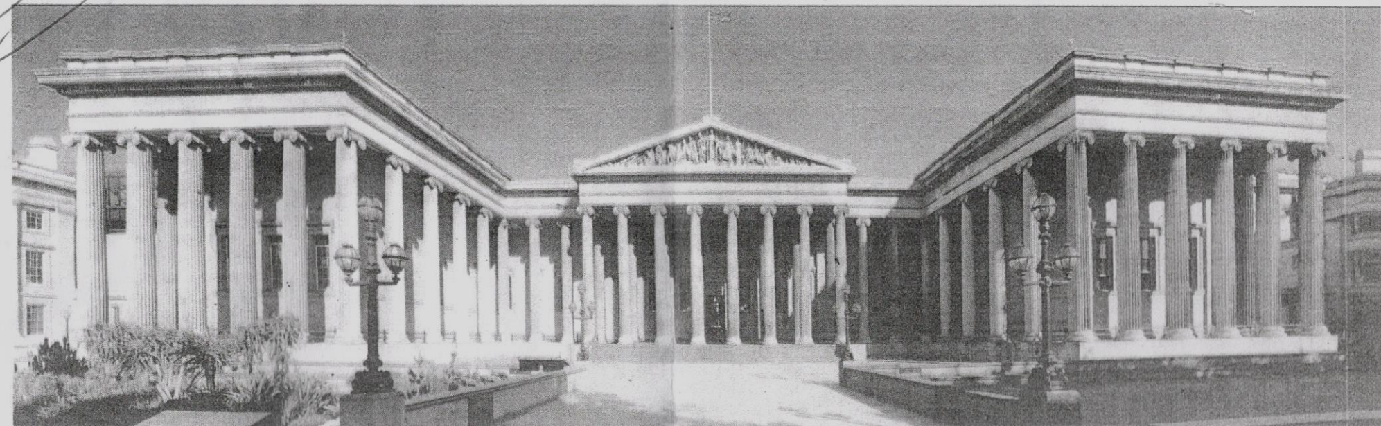
Will the Jalur Gemilang be flying high with this reverse colonialism in London?

ALTHOUGH an announcement was made several weeks ago, I've been waiting for the cascade of local interest in an announcement from the British Museum. Normally, not even the feeblest ripple from the museum's mighty press machine will reach the shores of Malaysia. I imagined this might be the exception, but so far it hasn't been.