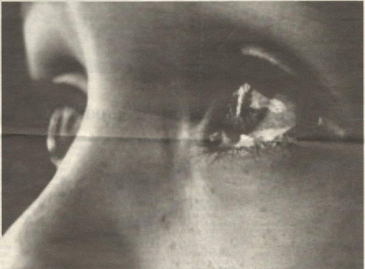
The Internet has helped to widen the reach of these predators , who only need an Internet connection to gain entry into our homes.