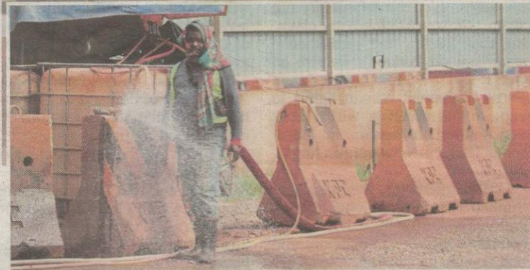
Lorries carrying bauxite plying the road in Kuantan Port yesterday. (Inset) A Kuantan Port worker using water to clear the road of bauxite dust in Kuantan yesterday.