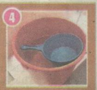
4 Water barrel