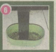
6 Ant trap