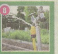
8 Leaky faucets and hoses