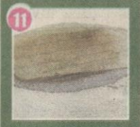
11 Concrete rooftop