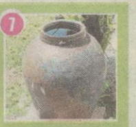
7 Rain barrel