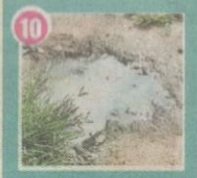
10 Stagnant water