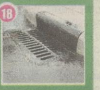
18 Storm drain