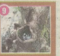
9 Hole in trees