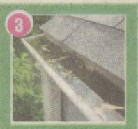
3 Clogged rain gutter