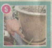
5 Water in plant pots and saucers