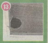
13 Damaged window and door screen