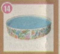
14 Neglected bathtub/pool