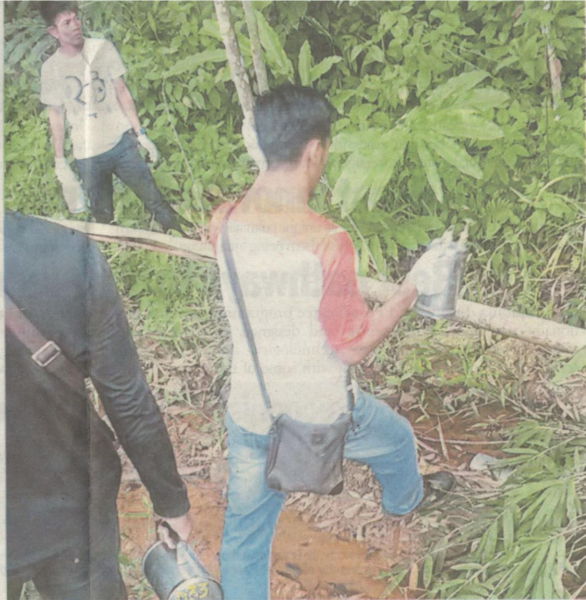
Health personnel destroying mosquito breeding grounds and carrying out larviciding in Pos Kemar, Griki last month.