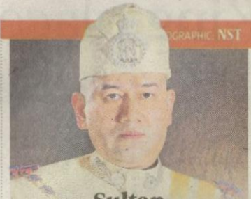
Sultan Muhammad V

Born Tengku Muhammad Faris Petra Sultan Ismail Petra on Oct 6, 1969 . Eldelst son of Sultan Ismail Petra Al-Marhum Sultan Yahya Petra.