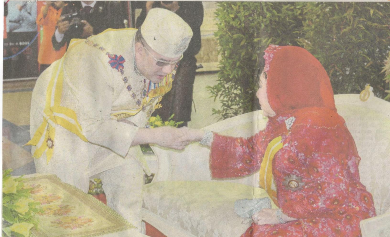
Sultan Muhammad V taking leave from his mother, Tengku Anis Tengku Abdul Hamid, at the Sultan Ismail Petra Airport in Pengkalen Chepa yesterday.