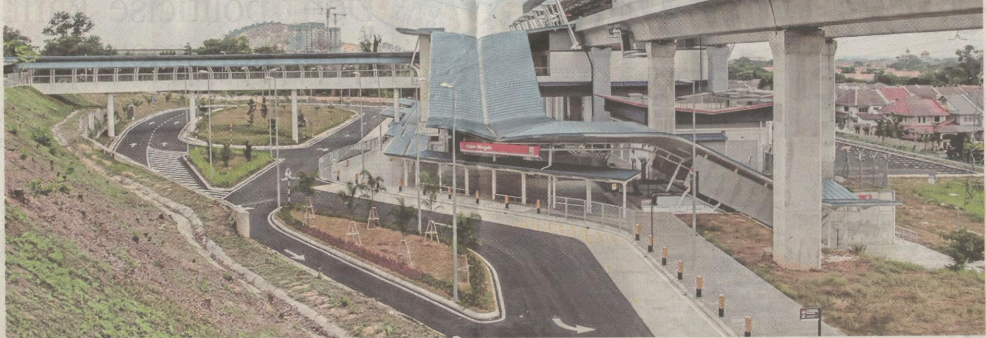
The new Alam Megah LRT station in Shah Alam.