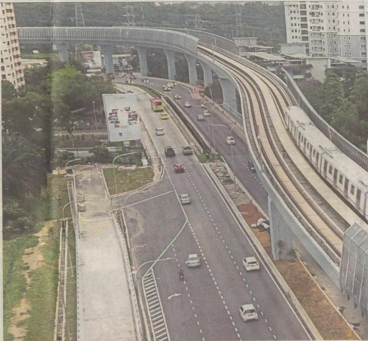
A test run of the MRT train at Sunway Damansara in Petaling Jaya yesterday.

Each train set serving the line, he said, would have four cars, which could ferry 1,200 passengers.