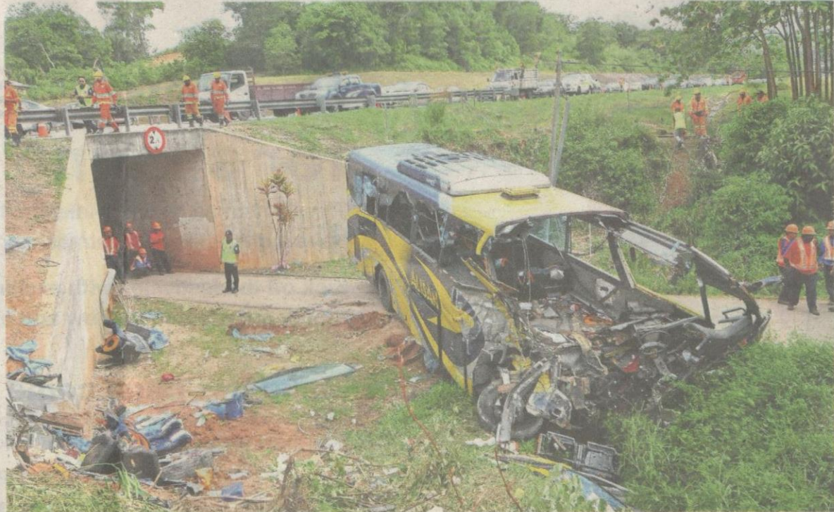
Tragic scene: The destroyed bus lying near the underpass in Kampung Jayo near Pagoh, Johor.

Baby among 14 killed in horrifying bus crash at Pagoh