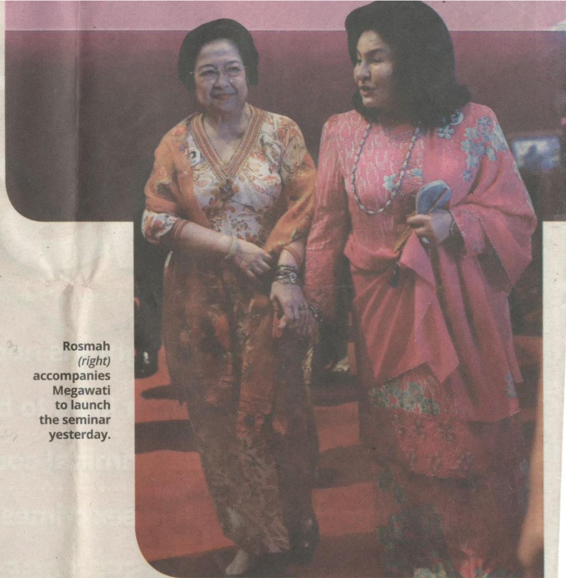
Rosmah (right) accompanies Megawati to launch the seminar yesterday.

"We are now faced with a daunting challenge in identifying these people, who we consider to be wolves in sheep clothing, blending with society."