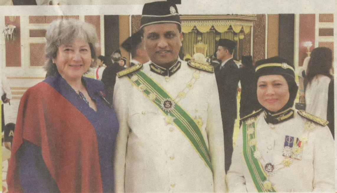
British High Commissioner to Malaysia Victoria Treadell posts this picture of herself with Deputy Foreign Minister Datuk Seri Reezal Merican Naina Merican and Minister in the Prime Minister's Department Datuk Seri Nancy Shukri on Twitter (@VickiTreadell).