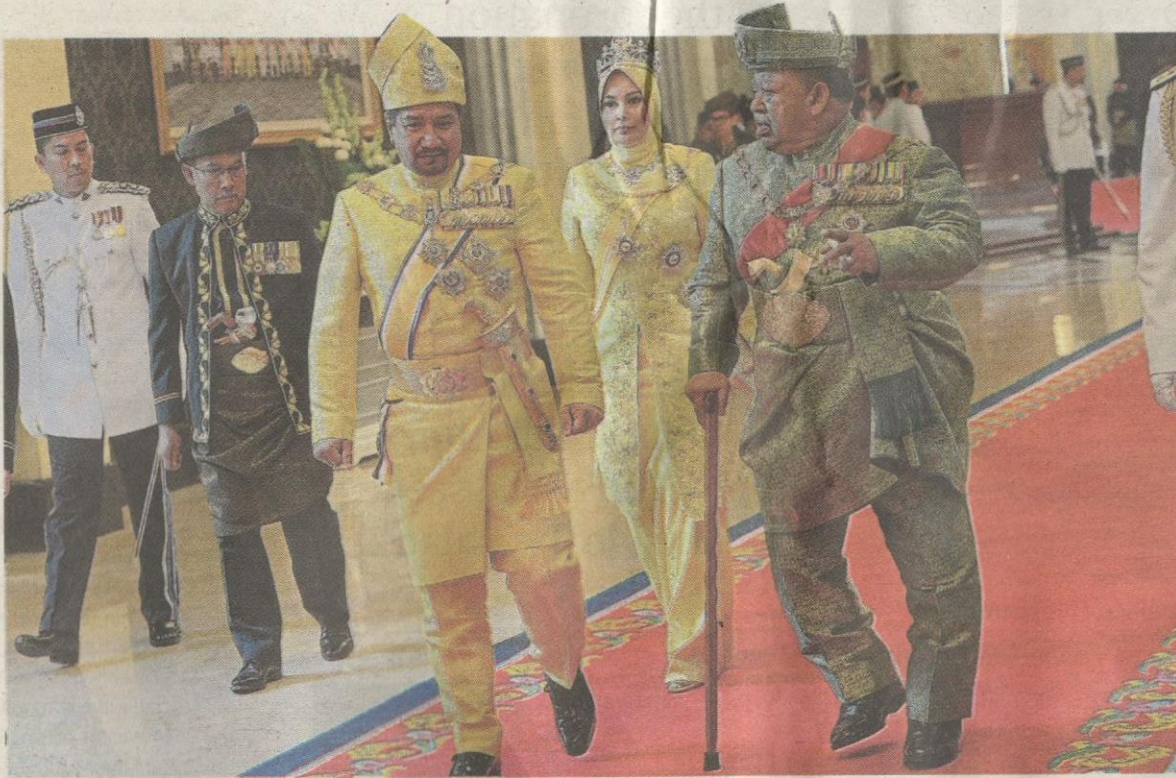
Raja Perlis Tuanku Syed Sirajuddin Syed Putra Jamalullail (right) joined by Sultan of Terengganu Sultan Mizan Zainal Abidin and his consort Sultanah Nur Zahirah.