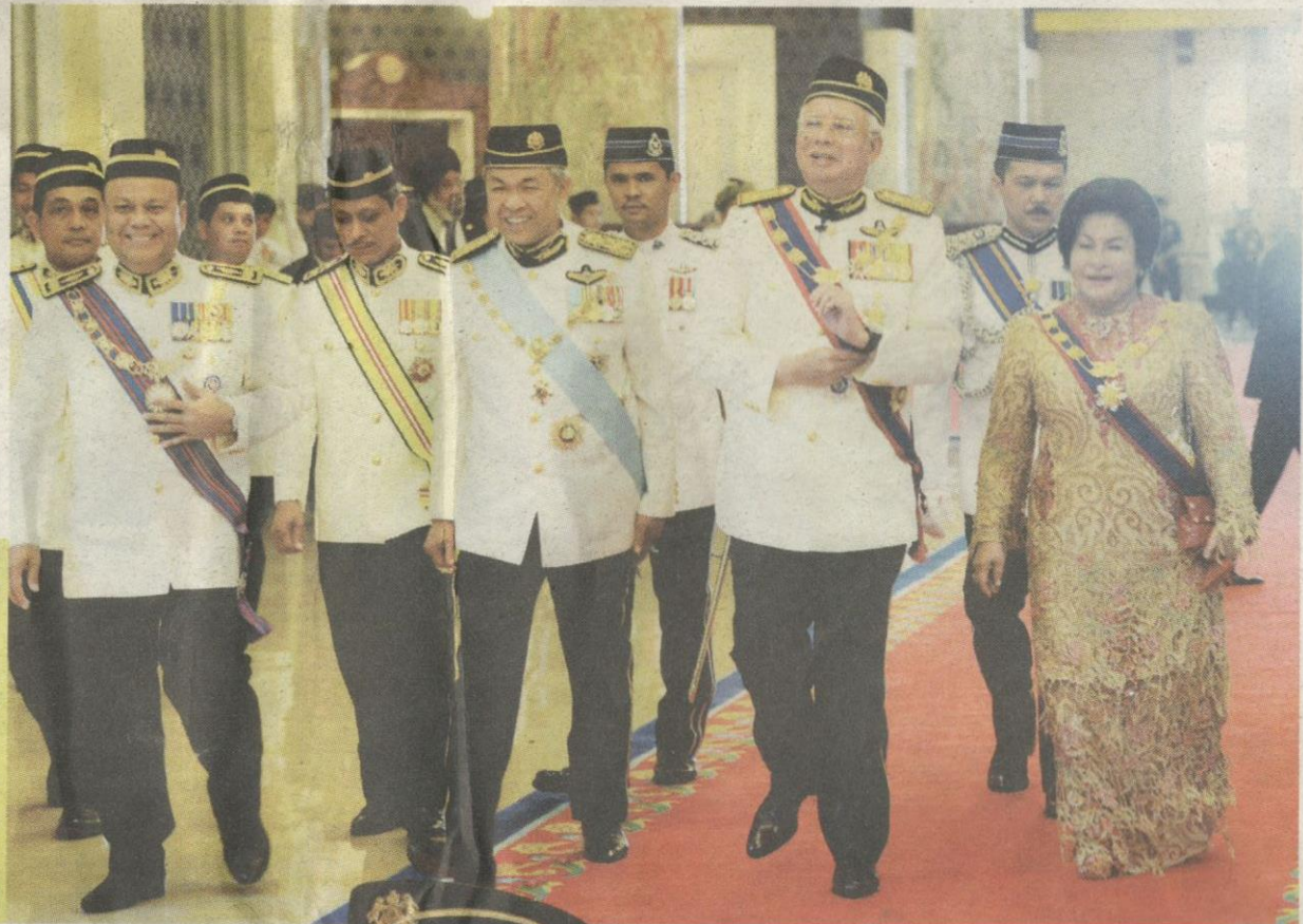
Prime Minister Datuk Seri Najib Razak flanked by wife Datin Seri Rosmah Mansor and Deputy Prime Minister Datuk Seri Ahmad Zahid Hamidi as they head to the Balairung Seri.

Some documented their presence by posting pictures on their social media accounts while others saw it as an opportunity to mingle around and meet old and new friends.