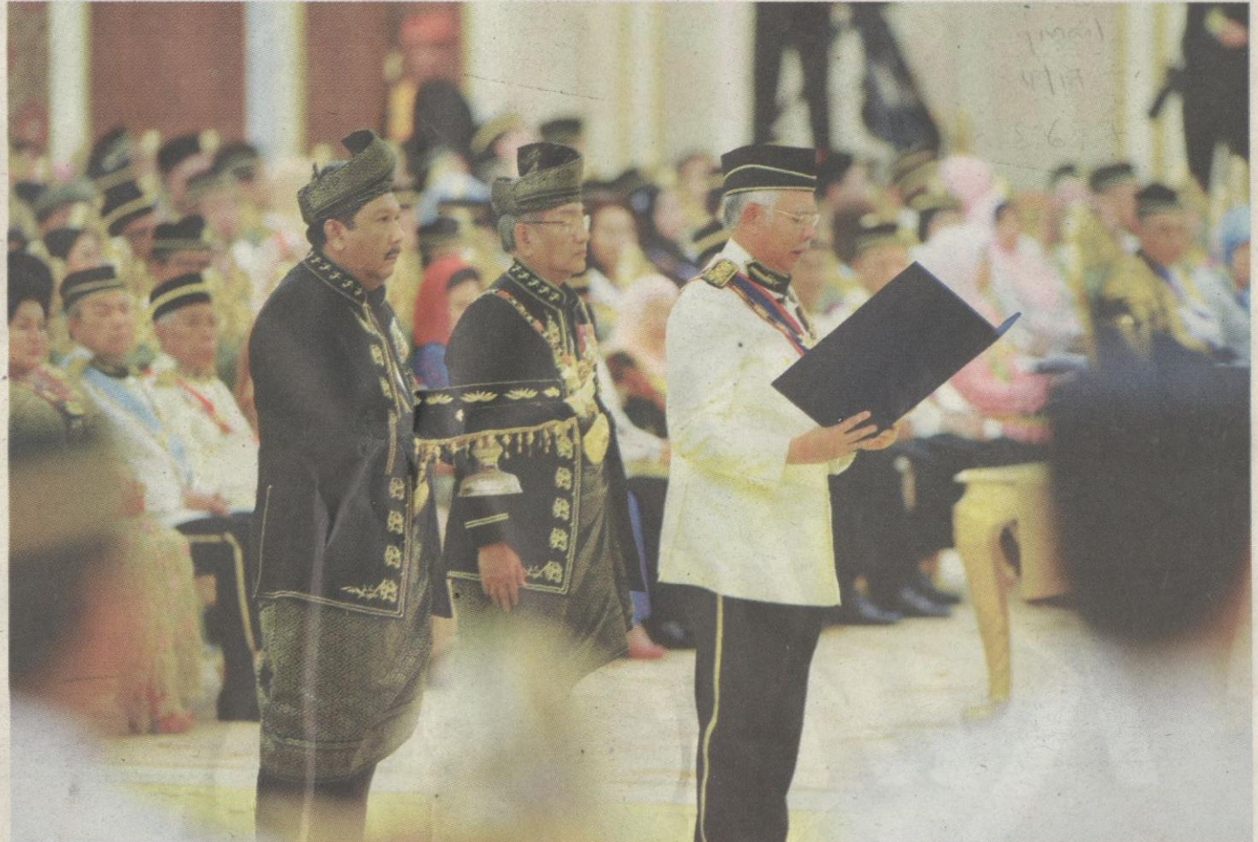
Najib reads his speech during the coronation at the Balairung Seri at Istana Negara yesterday.