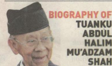
BIOGRAPHY OF TUANKU ABDUL HALIM MU'ADZAM SHAH

Born on Nov 28, 1927 , at Istana Anak Bukit, Alor Star, Kedah to Sultan Badlishah and Tunku Sofiah Tunku Mahmud