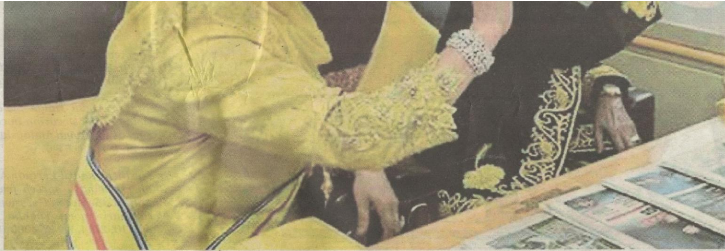
Sultan of Kedah Sultan Abdul Halim Mu'adzam Shah and Tuanku Hajah Haminah waving as they returned to Alor Star after completing his second term as the Yang di-Pertuan Agong.

I didn't know why the hall erupted into laughter, and my dad turning blue, as I clasped my hands to my chest and bobbed