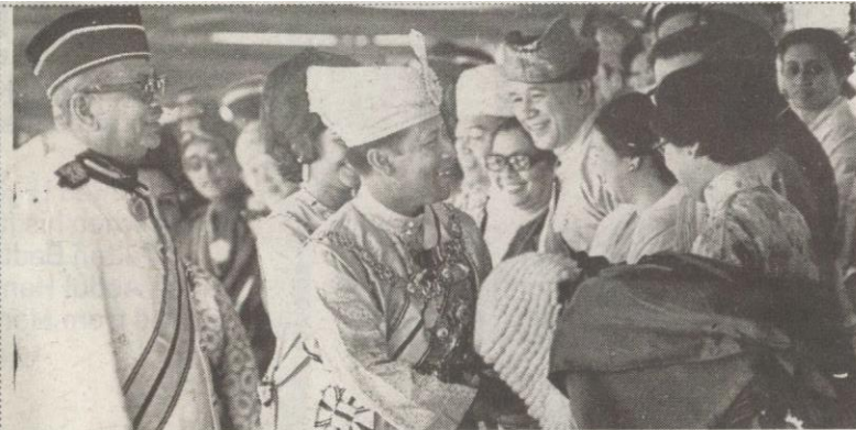
Sultan of Kedah Sultan Abdul Halim Mu'adzam Shah at his installation as the 5th Yang di-Pertuan Agong in 1970. With him is the first prime minister, Tunku Abdul Rahman Putra Al-Haj.

He was also a great supporter of the state football team.