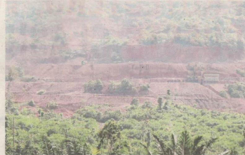
Uncontrolled logging, mining and farming near Tasik Chini must be checked.

"The Orang Asli community here is renowned as rattan collectors but, now, youths tap rubber and do odd-jobs to earn a