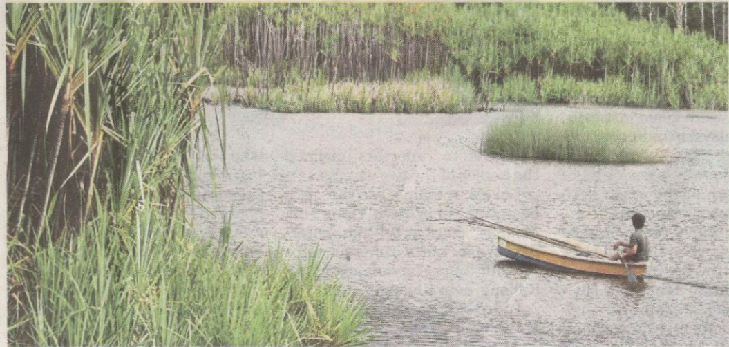
Efforts are under way to turn Tasik Chini into a popular tourist destination again.