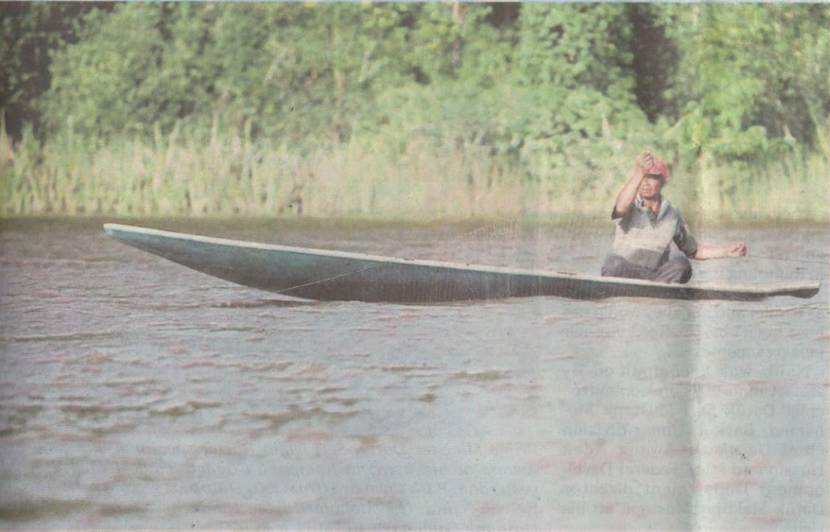
A man fishing in Tasik Chini.

Prime Minister Datuk Seri Najib Razak, during a visit to the lake in October last year, reaffirmed the government’s commitment to conserving and preserving the coun-