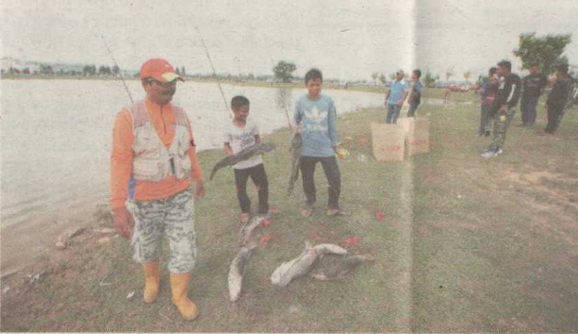
About 2,100 people took part in the fishing competition which was part of the two-day carnival.