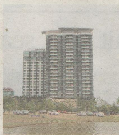
One of the condominiums in Selangor Cyber Valley... just next to the lake.

Formerly known as Taman Sains Selangor II, it was launched by former Selangor Menteri Besar Datuk Seri Mohamed Azmin Ali in March 2017.