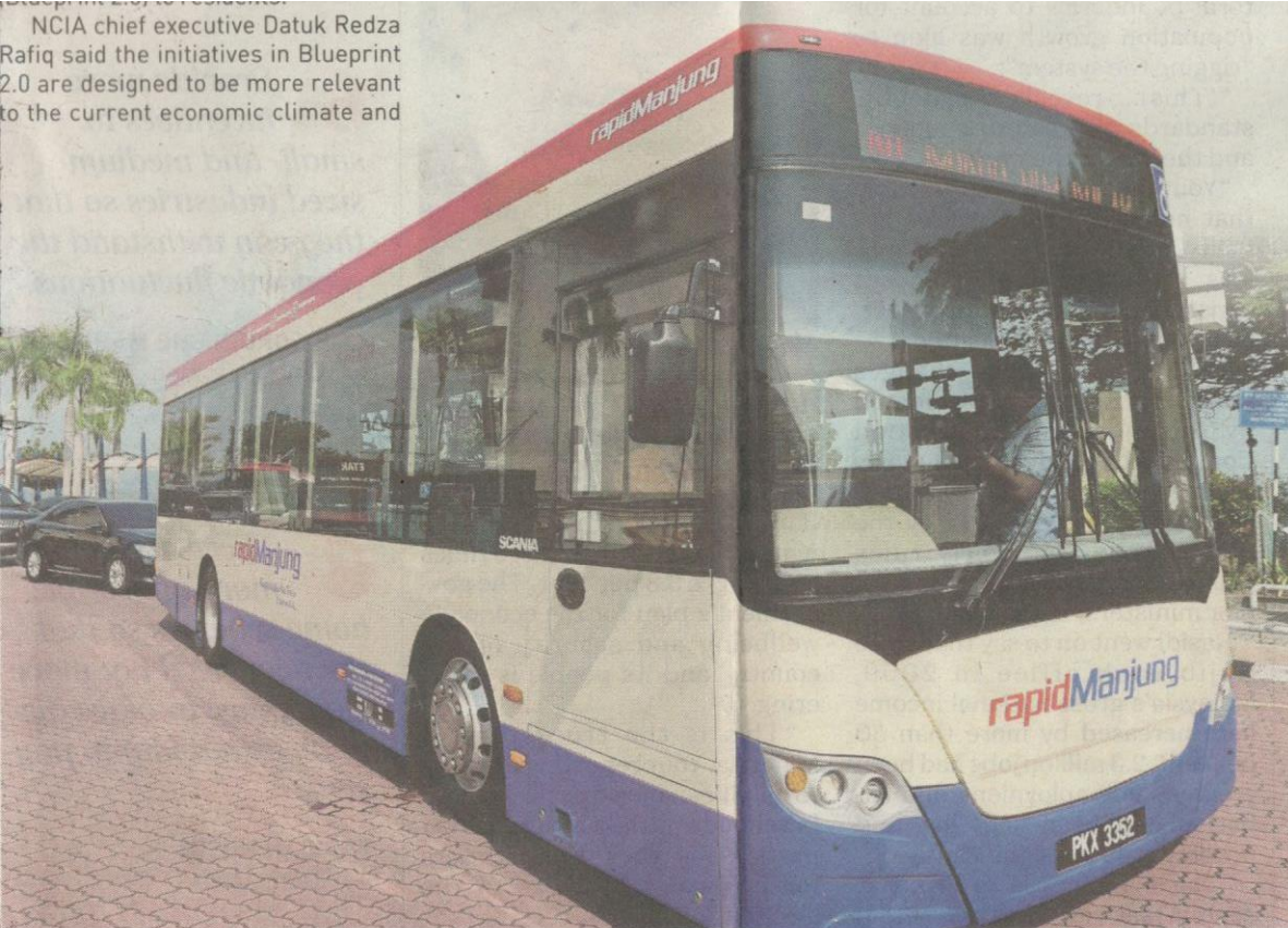
The Rapid Manjung bus service plies two routes in Manjung.