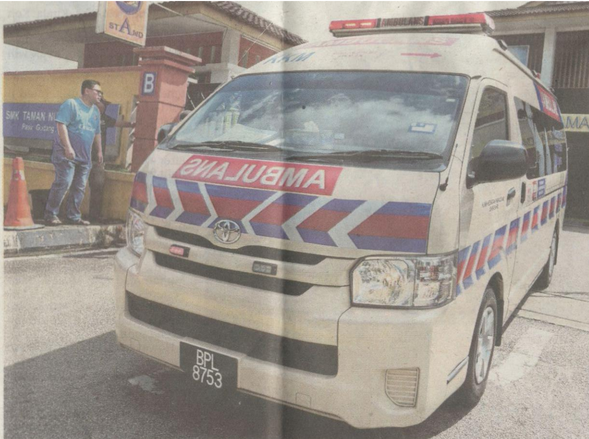
An ambulance carrying schoolchildren leaving SK Taman Nusa Damai in Pasir Gudang yesterday.