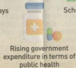
Rising government expenditure in terms of public health