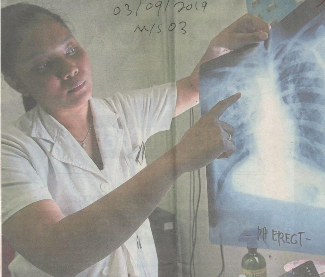
A chest x-ray of a TB patient will be filled with patchy opacities and cavities indicating infection waiting to rupture and disperse germs into the air.

Latent carriers, he said, did not display any symptoms and could unknowingly spread the bacteria to others.