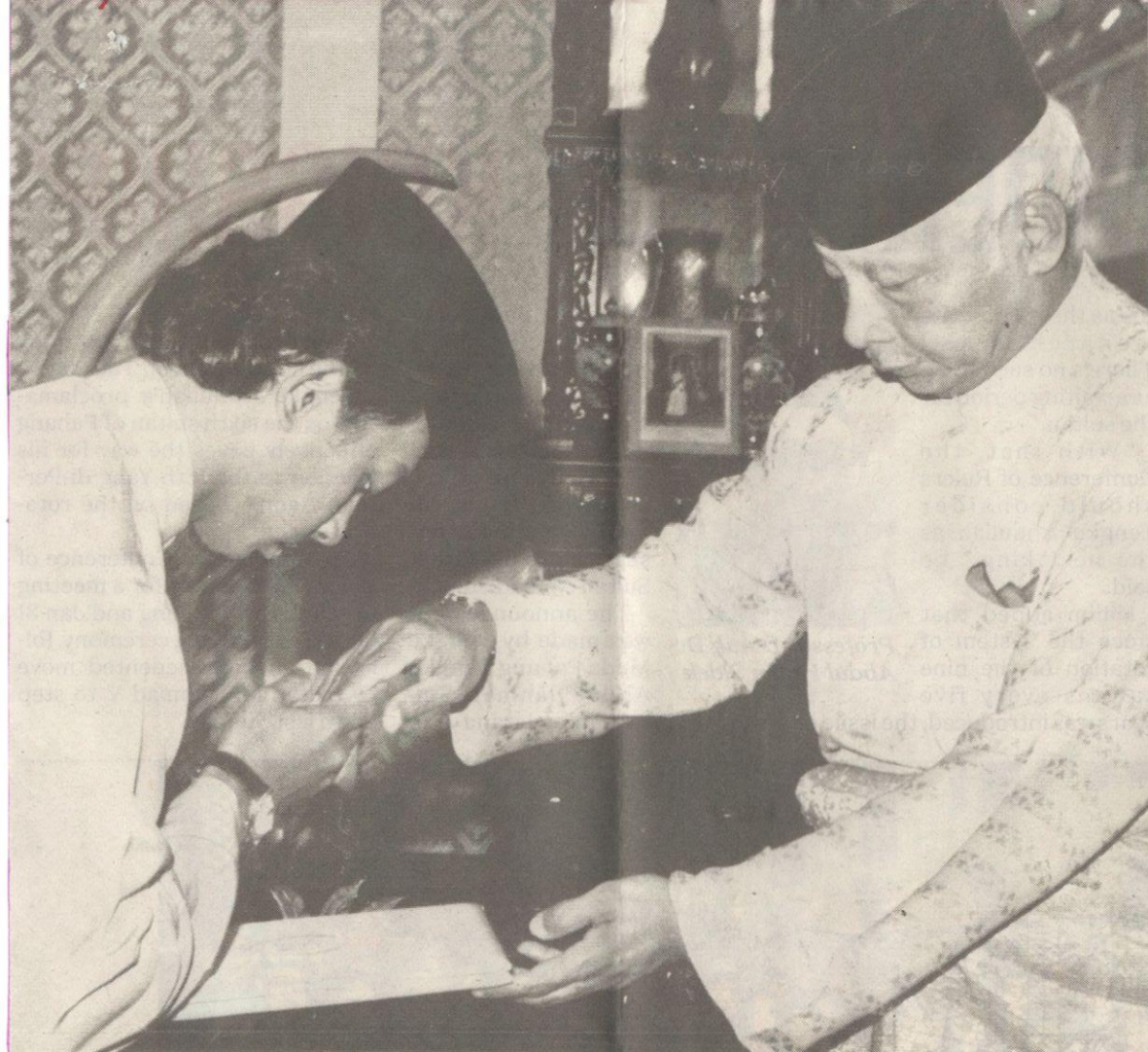
A file picture of Sultan Ahmad Shah and Tengku Abdullah.