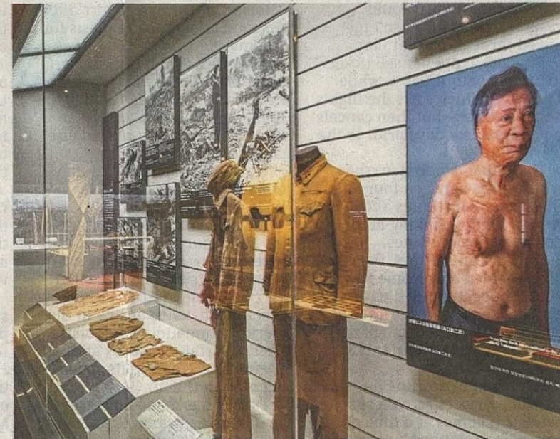
Exhibits are seen on display at the Nagasaki Atomic Bomb Museum in Nagasaki in August. This year marks the 75th year of the bombing of Nagasaki and Hiroshima.