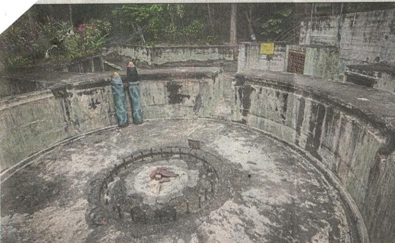
The Penang War Museum is located on a hillside in Batu Maung.