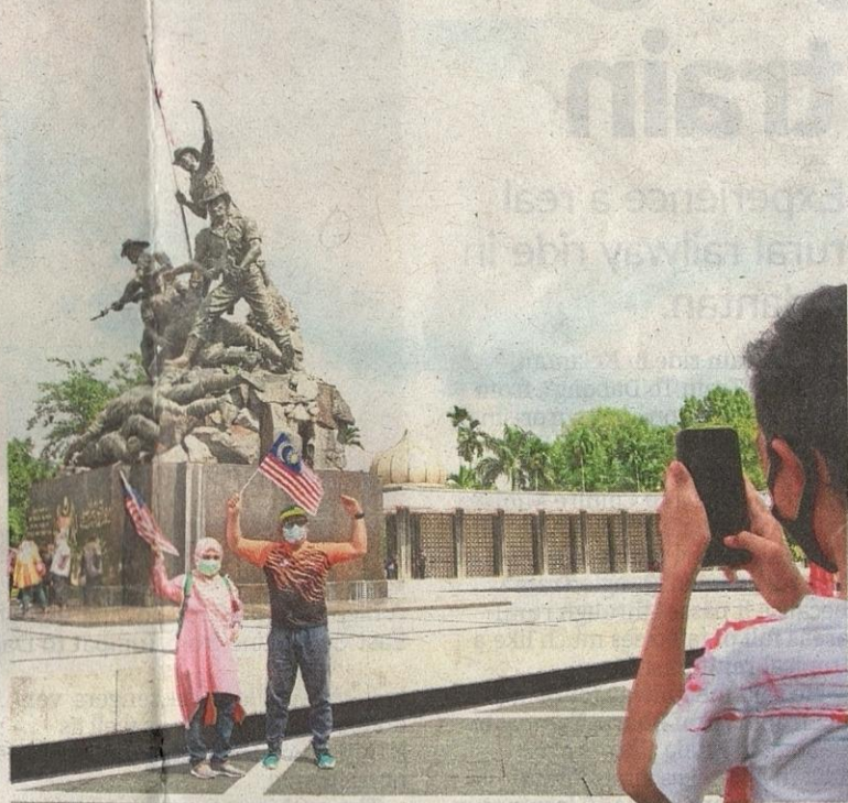
Tugu Negara is the world's tallest bronze freestanding sculpture grouping.

Make a trip to the war memorials for a reminder of the struggles in achieving the country's independence.