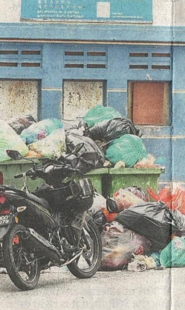
Rubbish overflow is becoming a problem for high-rise dwellers as the refuse chambers are unable to take the large volume of waste

"Stagnant water among the rubbish piles can lead to a dengue outbreak," she said.