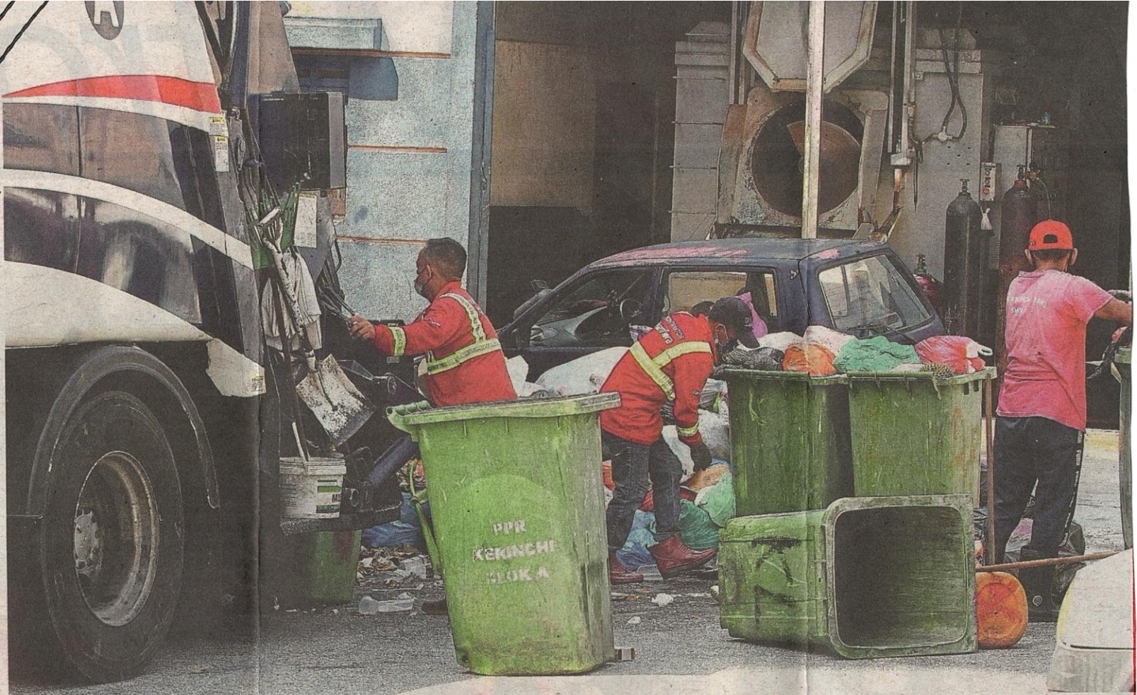
Alam Flora workers loading bags of household waste onto a truck at PPR Kerinchi in Kuala Lumpur.

Drawing club -- Buds for Kids Organics -- will have free Zoom drawing classes with teacher Komeil, every Saturday at 3pm. It starts on Sept 4. Participants will learn to draw cartoons among other cool stuff. All abilities and ages are welcome. Participants