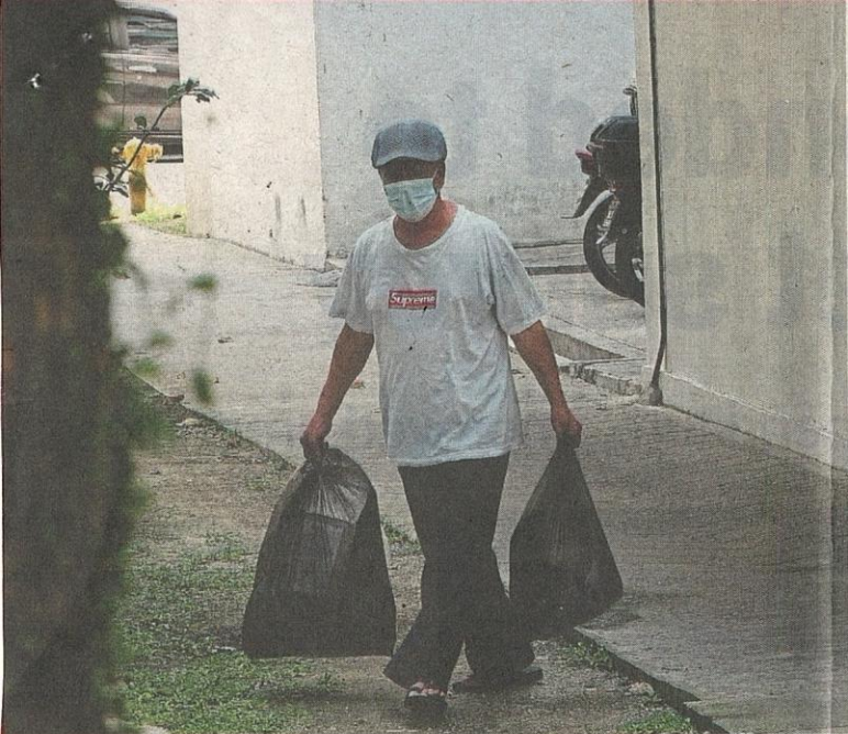
Occupants of stratified residences are required to dispose off rubbish at designated facilities within the premises.

“Some people are just lazy to go to the facility on the ground floor, so they take the easy way out by dumping rubbish in common areas.