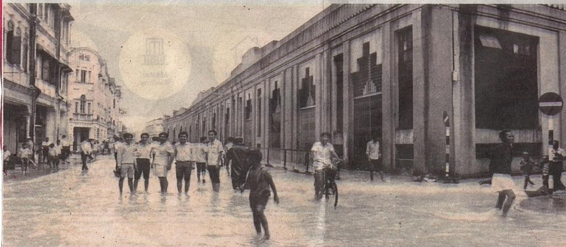
Residents explored the streets near the Central Market after the flood receded.

Burst pipelines, wayward floating debris and garbage threw other forms of communication with-