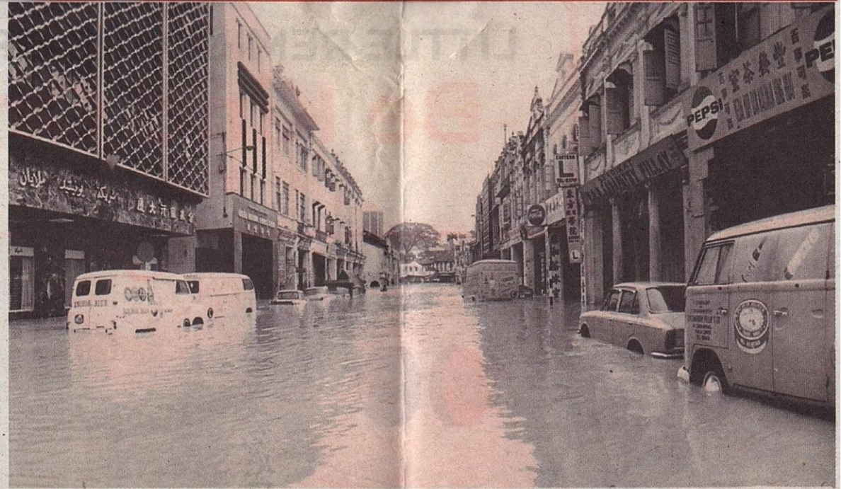
Kuala Lumpur streets were deserted during the 1971 flood.