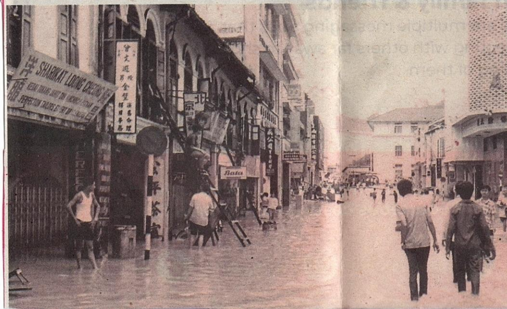
Pre-war shophouse residents used ladders to access the upper floor during the flood.

At the same time, it warms the heart to see many organisations answering the government's call to lend affected flood victims a much needed helping hand. Having said that, it is time for us to make a small contribution to Tabung Bencana NSTP-Media Prima by either depositing directly in Maybank account 5141-0532-0757 or mailing a personal cheque to Jabatan Komunikasi Strategik, Media Prima Berhad, Tingkat 4, Anjung Riong, Balai Berita, 31 Jalan Riong, 59100 Bangsar, Kuala Lumpur.