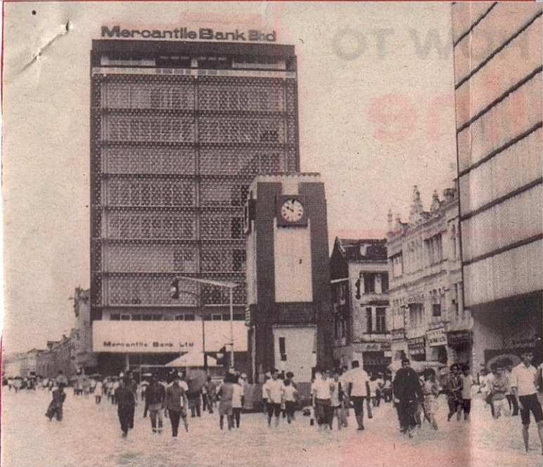
After the flood, people made a beeline for the financial institutions and shops around Medan Pasar.