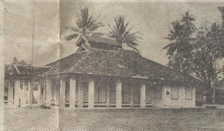
Students suffering from minor ailments were treated at the sick bay.