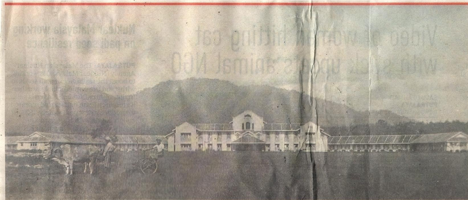
Students began using the main building of the Sultan Idris Training College after it was declared open in 1922.