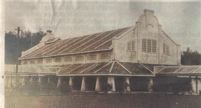
The dining hall and kitchen building at the Sultan Idris Training College.