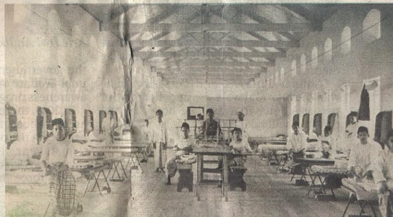
Students posing for a picture at one of the six residential hostels at the Sultan Idris Training College.

turned in September 1945, those present realised that things were no longer the same.