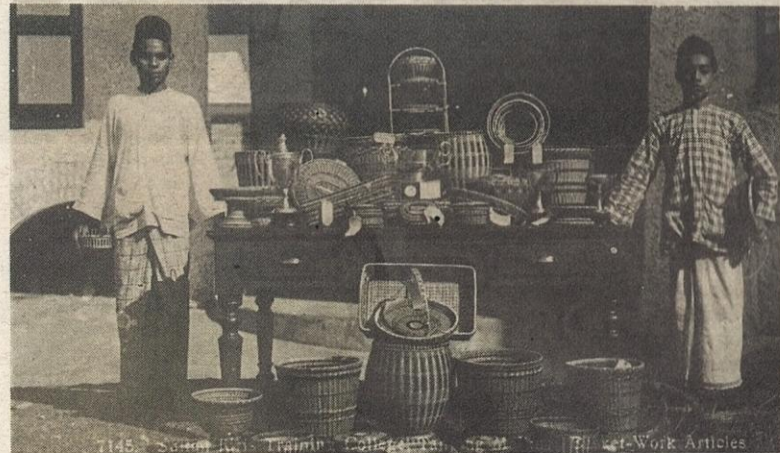
Students posing proudly with their woven products.

A year later, the inclusion of two Javanese teachers into the teaching force gave rise to SITC's own craft school, where students honed their skills on the finer as-