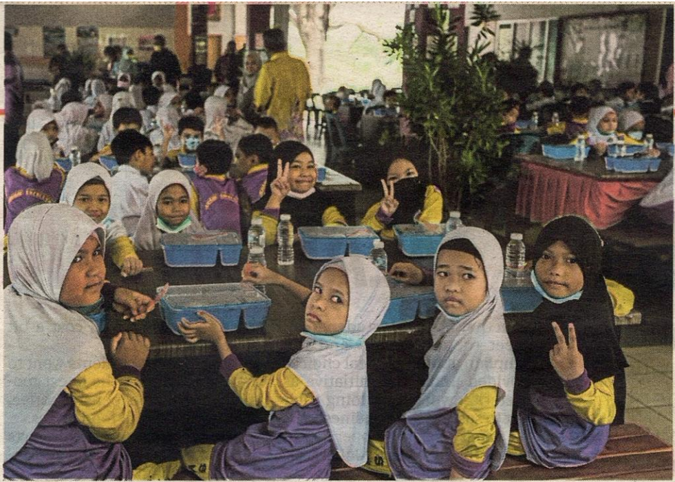
Pupils of SK Haji Salleh Masri in Kuala Kedah having their meals provided under the Healthy Food Programme 2022 (Promak) yesterday.