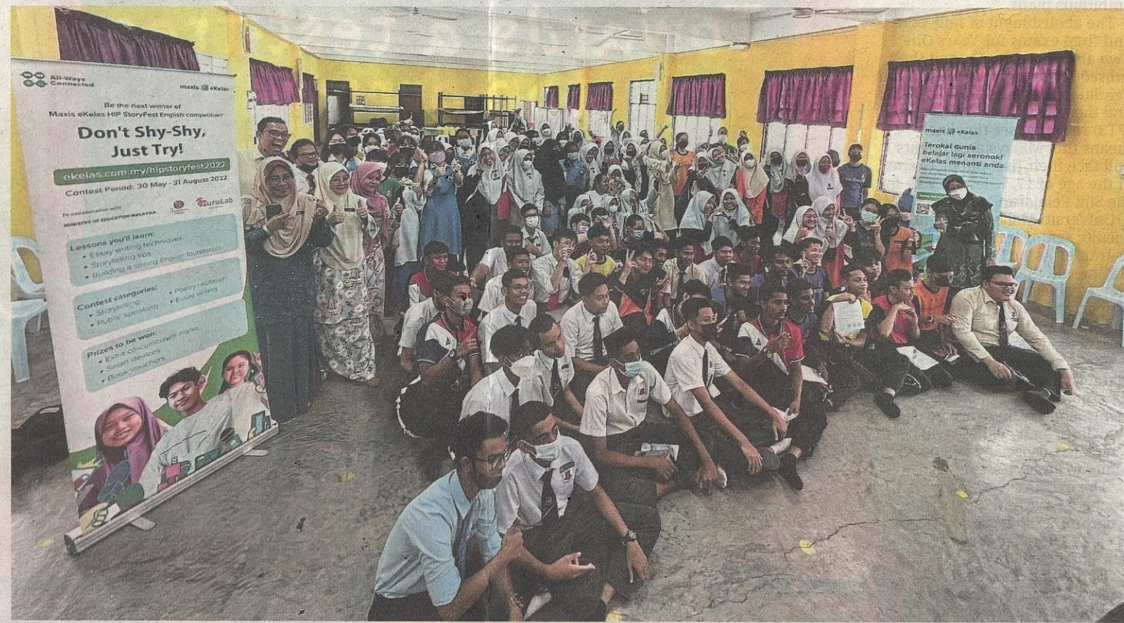
Form 5 students of SMK Putri Wangsa in Ulu Tiram, Johor, attending an eKelas HIP English StoryFest Competition 2022 roadshow.

Since its launch in November 2016, eKelas has seen strong growth, with the programme implemented at 118 Malaysian Family Digital Economy Centres (PEDI) under Maxis care nationwide, connecting more than 54,000 students and expanded to over 1,050 schools.