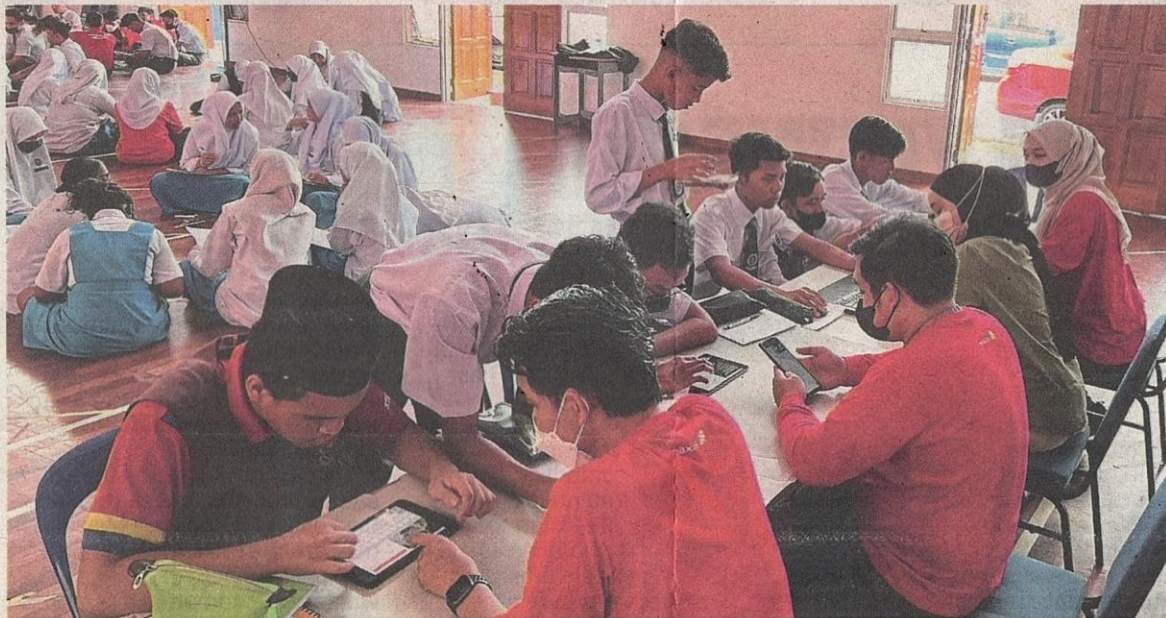
Students at SMK Taman Scientex in Pasir Gudang, Johor Baru, signing up for Maxis eKelas.

ing number of students participating in the competition every year, with more than 3,500 last year alone," said Maxis chief corporate