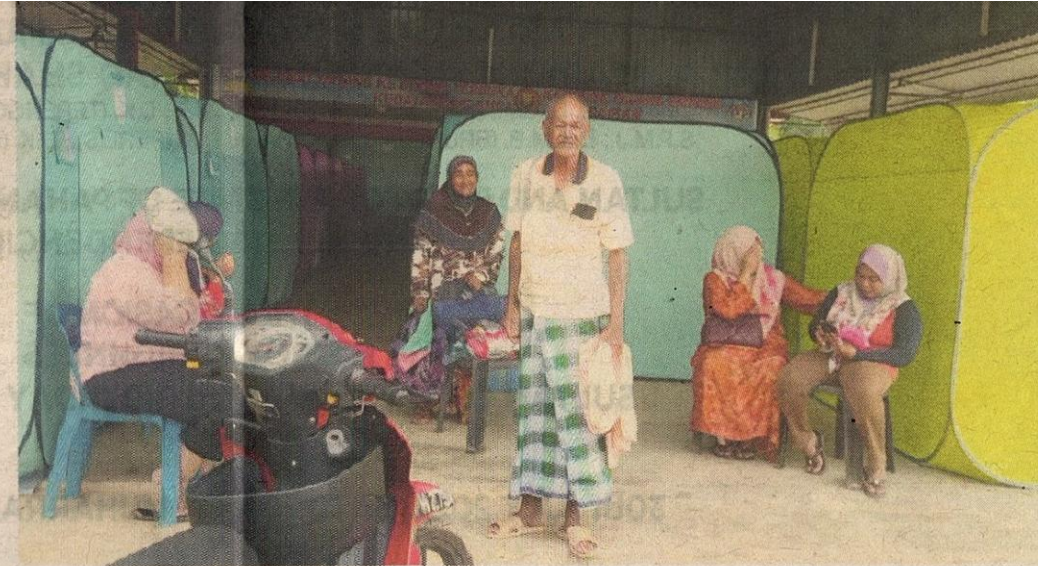
Flood victims gathering at a temporary relief shelter in Baling.