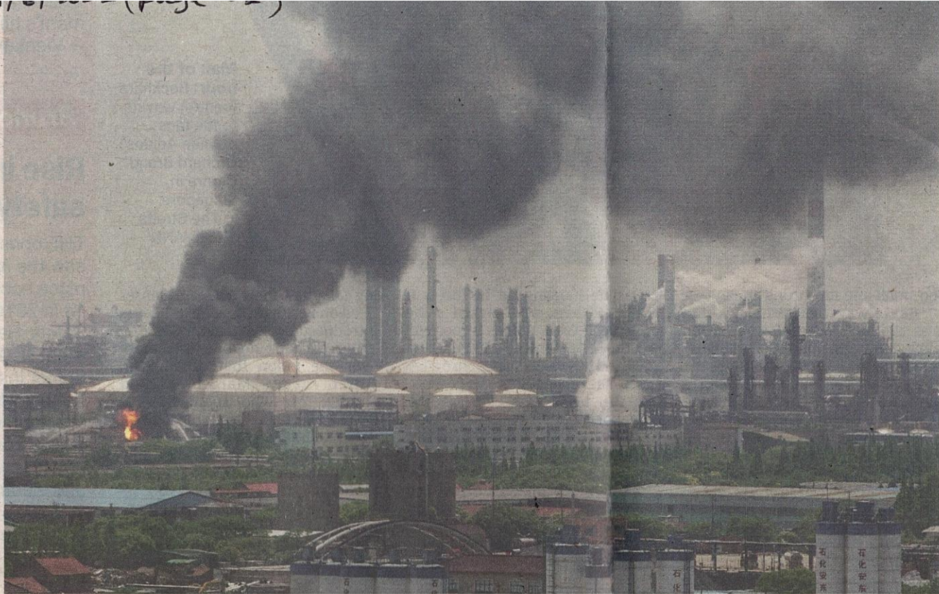
Where there's smoke: Smoke billowing from the plant after the explosion in Jinshan district, Shanghai.