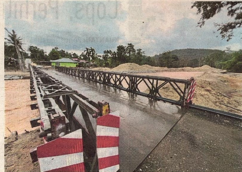
Muddy Sungai Kupang water flowing past Kampung Iboi in Kupang, Baling.

This follows the finding by federal agencies that the floods were triggered by a burst reservoir at the plantation.