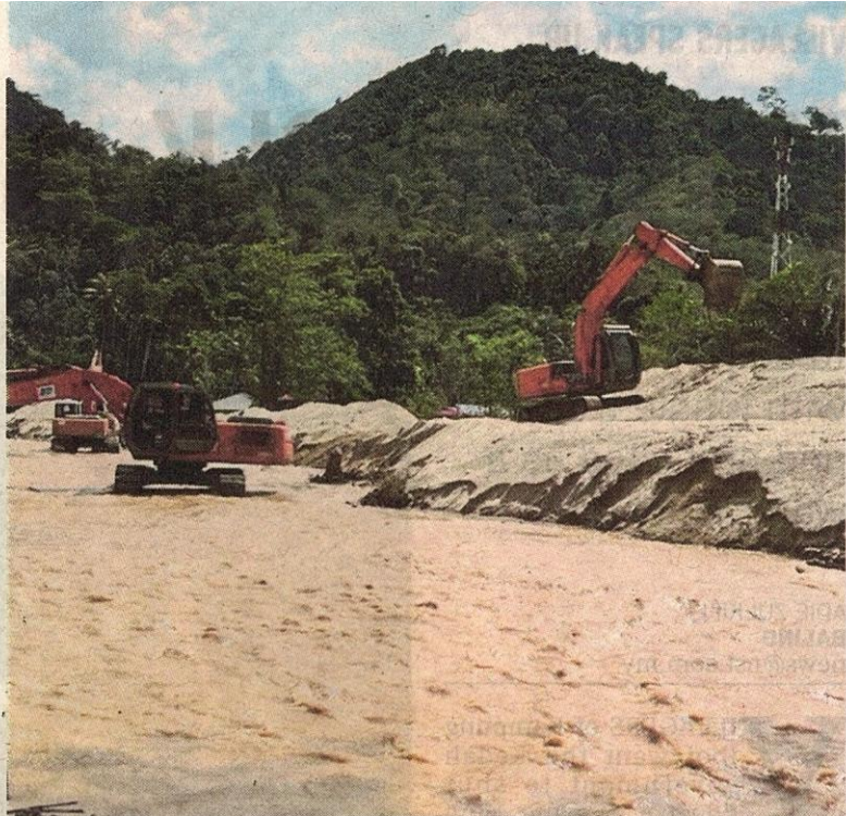
Excavators removing sand and mud in Sungai Kupang, Baling, recently.