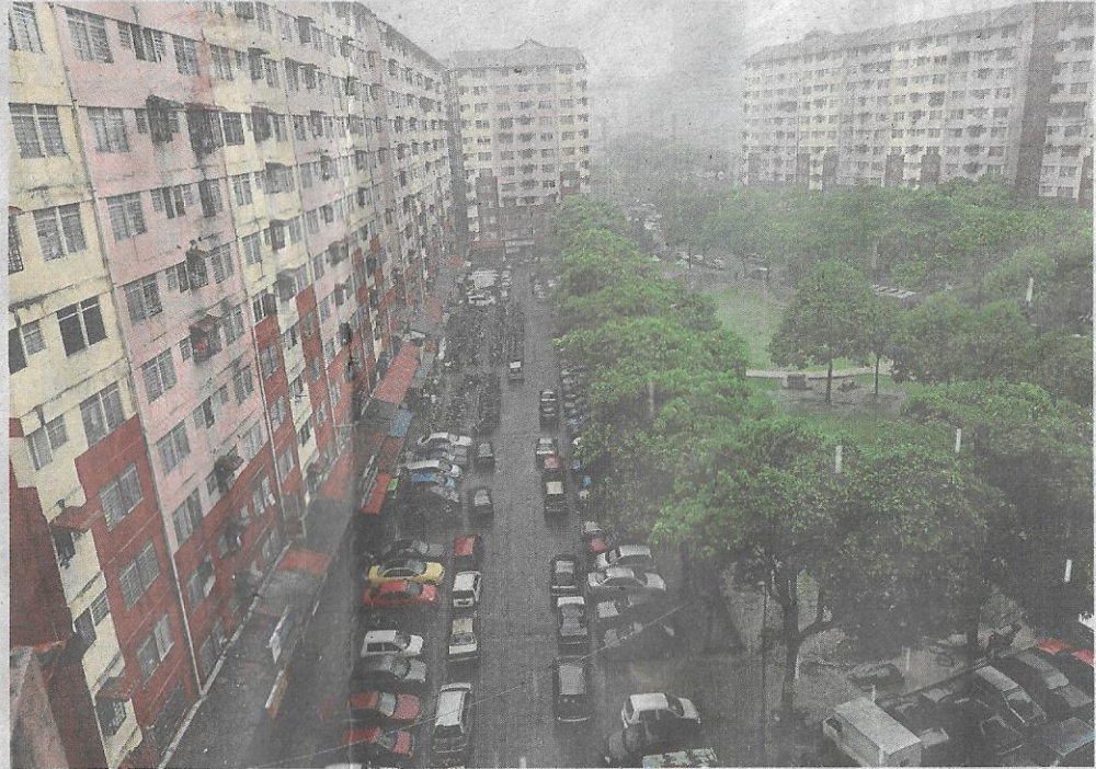
Desa Mentari has eight high-rise blocks of low-cost flats. — Filepic

to serve the people, especially during the Covid-19 pandemic, regrettably, we still lost the fight this round.