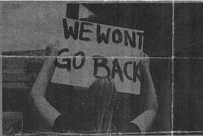
Abortion-rights supporters rally last month in Fort Lauderdale, Florida, US.

"They want to remain pregnancy-free, because now you cannot