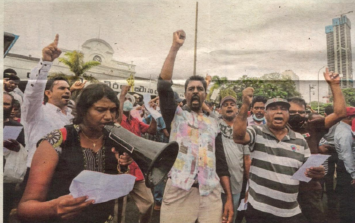
Protesters shouting slogans after soldiers forcibly evicted protesters from the president's secretariat premises in Colombo, Sri Lanka, yesterday.