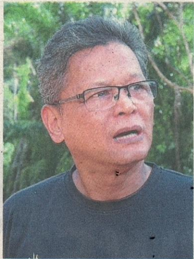
Ishak says the NGOs need support from the private sector to do their community work.

"NGOs, on the other hand, have no such restrictions and can channel aid faster to the intended recipients," she added.