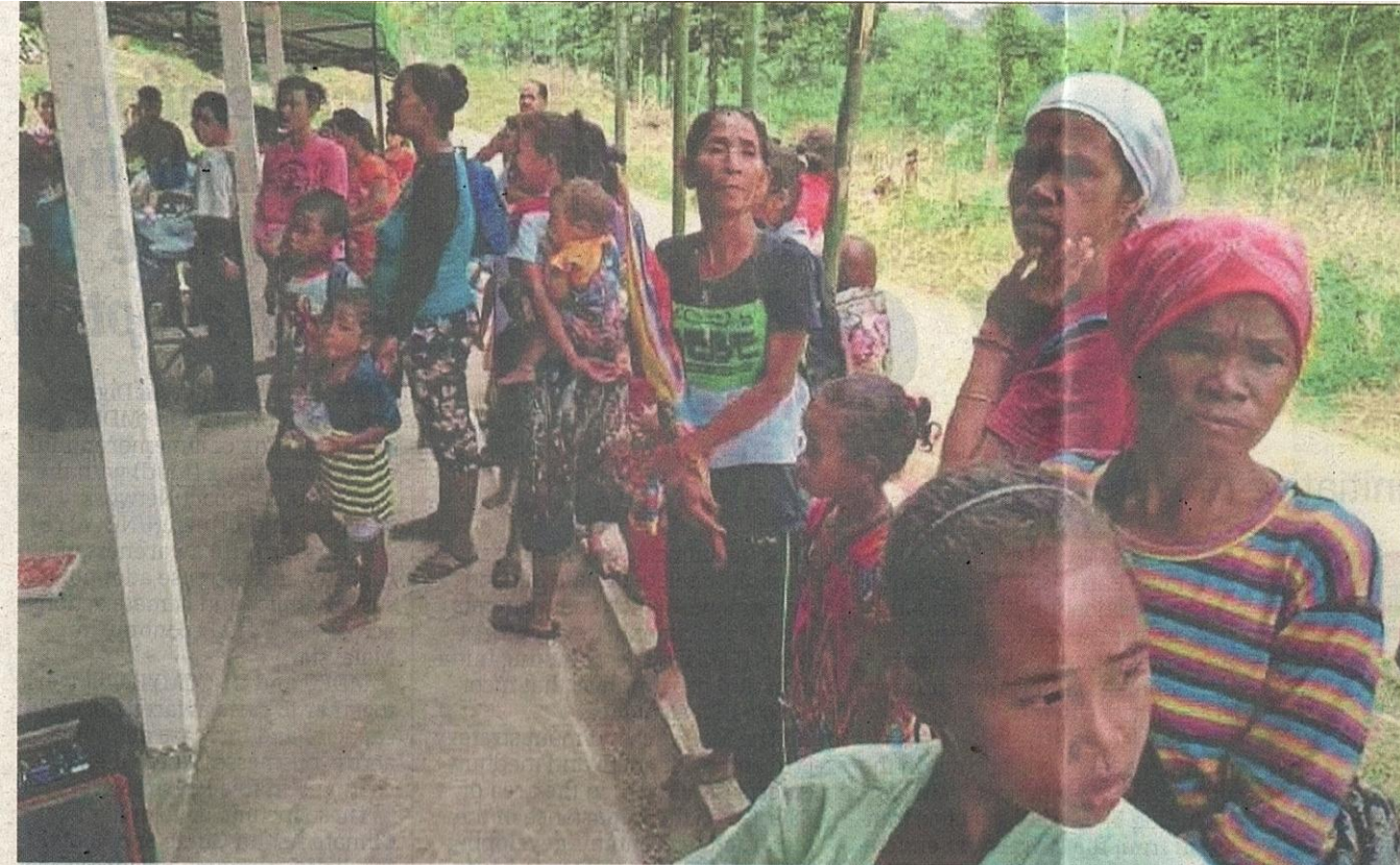
Orang Asli villagers waiting to get medical treatment at an outpost in Ulu Jelai, Pahang.