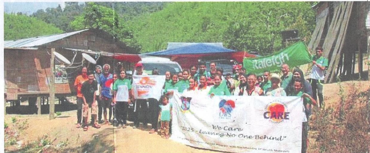
The DRsforALL initiative is an outreach programme that provides medical and healthcare services to the Orang Asli in Kampung Dayok in Ulu Jelai, Pahang.

"We must understand that these communities deserve equal attention as those in urban areas," she said.