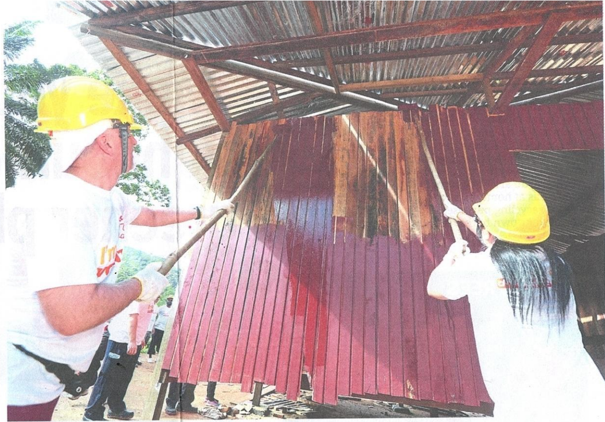
Corporate volunteers painting a new house built under Insaf Malaysia to help the Orang Asli in Negri Sembilan own homes.