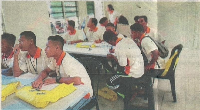
Youths from Kampung Dayok, Pahang, undergoing DRsforALL's training programme to become a paramedic.