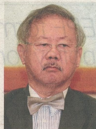
Dr Chow proposes that NGOs and companies adopt a specific village to better understand their needs.