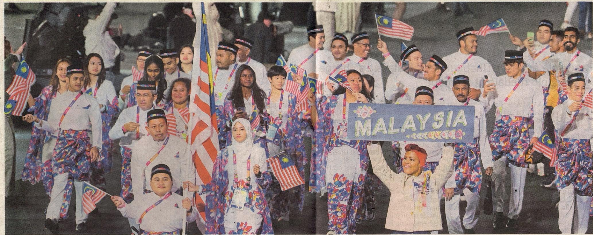
The Malaysian contingent make their entry into the Alexander Stadium during the opening of the 2022 Commonwealth Games in Birmingham on Thursday.